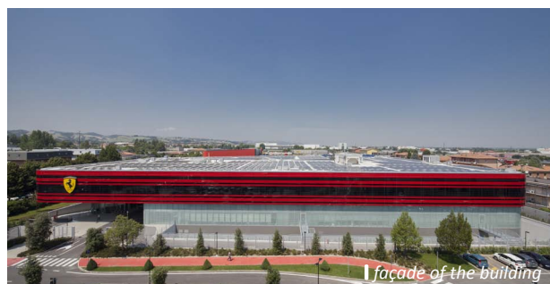
facade of the building

Style, functionality, efficiency and innovation are the main lines of the architectural plan, which aim at improving the workplace conditions and facilitate cohabitation of the different activities housed inside the building. Three main streams coexist in this space: the GeS employees, the external visitors and the materials/products. One of the key challenges of this project was to organise them by designing efficient and harmonious floor plan layouts.