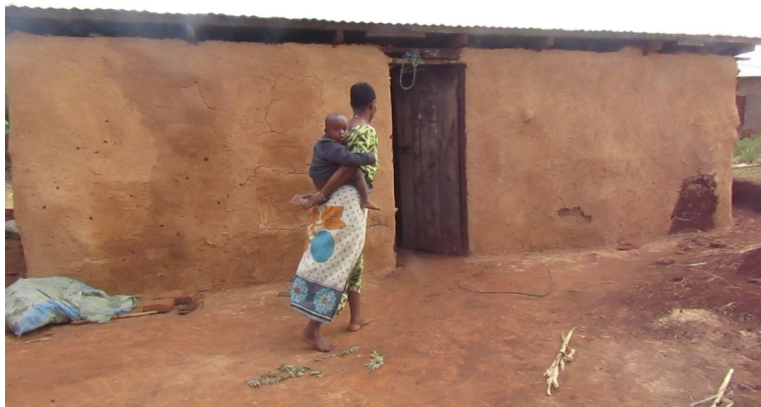
Hut: used as interior kitchen and storage.