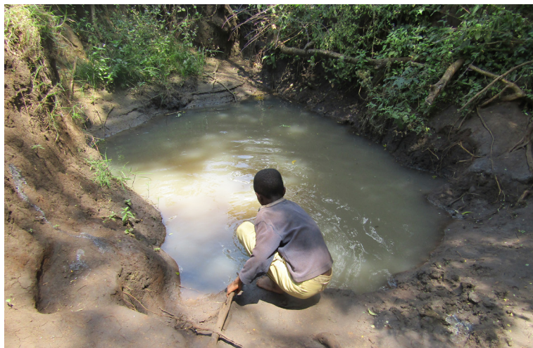
Scoophole where they fetch water

The budget for the house is 20.000€ (50 milion Tanzanian Shilling). A list of price references, along with a site plan, will be sent after registration.