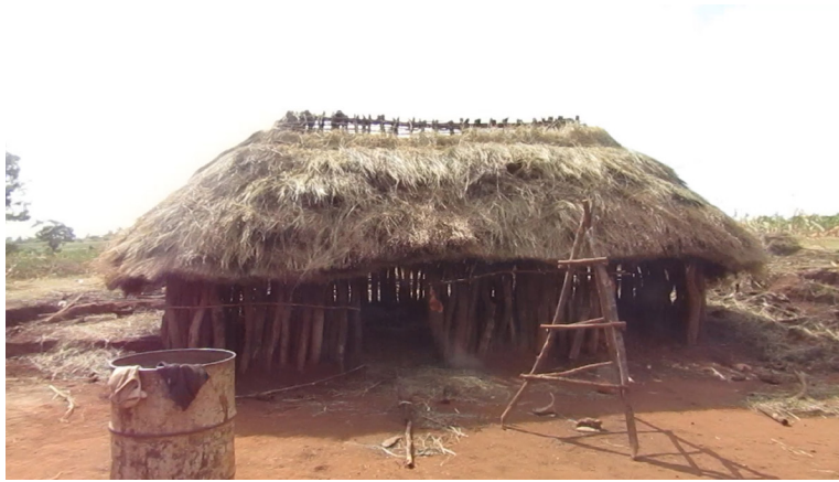
Hut: this one is being rebuilt. Dad is currently sleeping here.