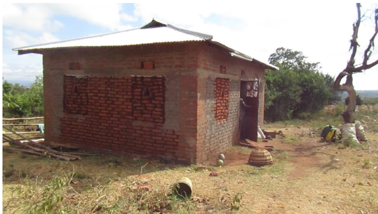
Nico's brick house: still under construction.