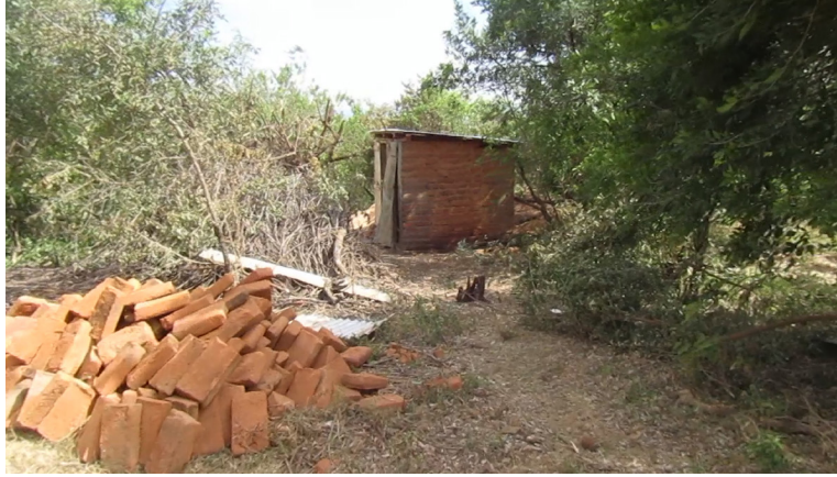
Shower and latrine module