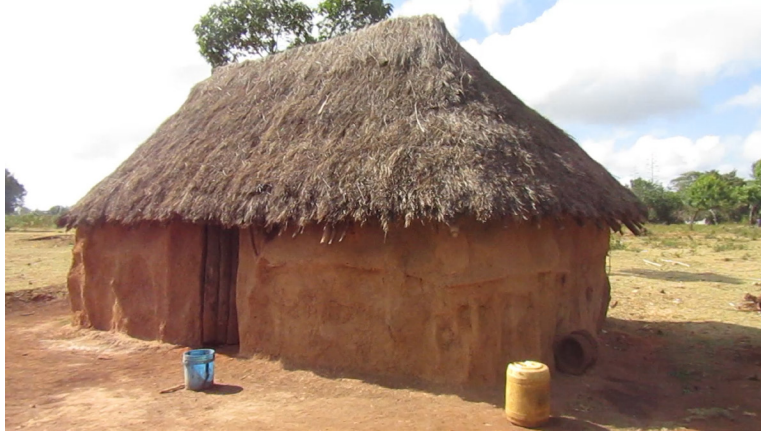
Hut: this is where most of the family sleep, sharing the space with some small animals such as chickens or ducks.